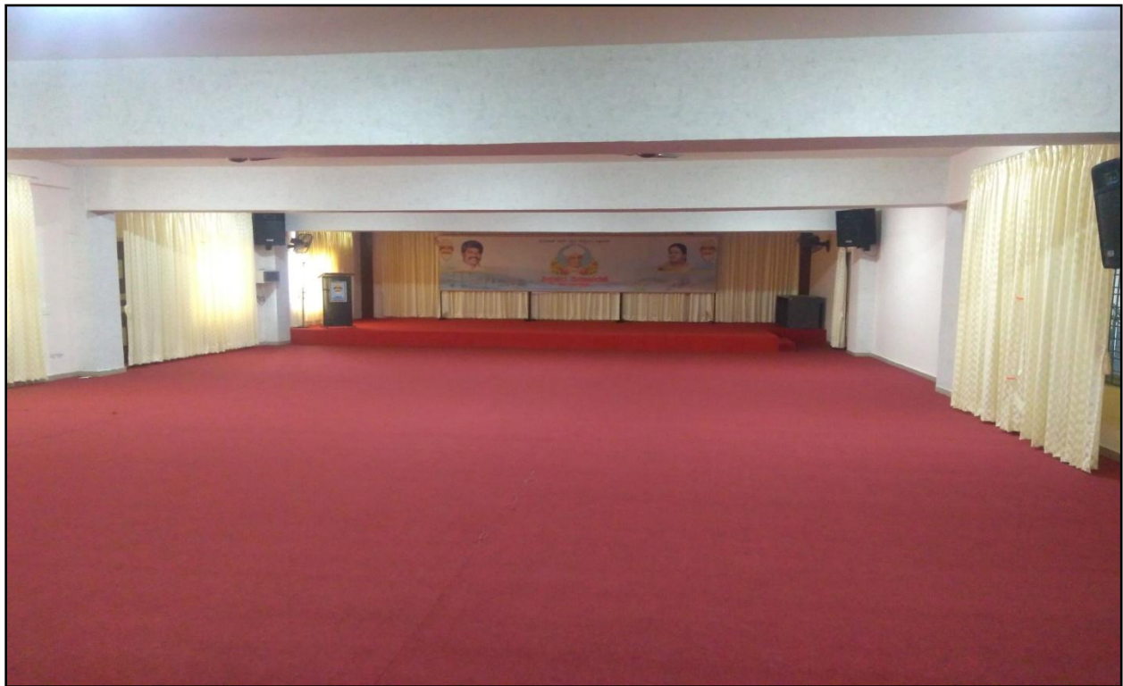
Multi Purpose Hall