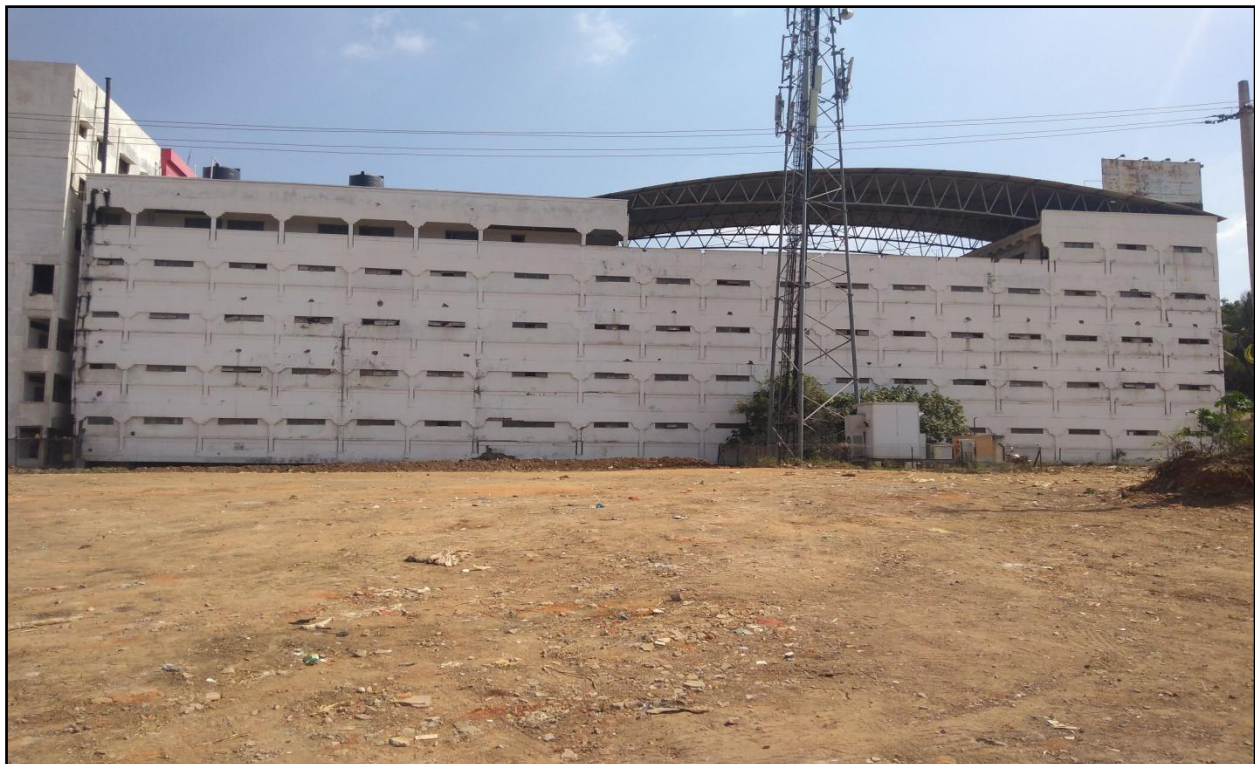
College Rear view