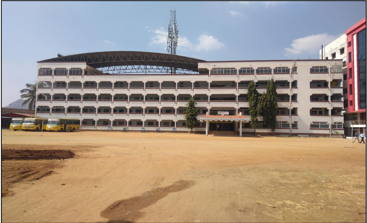
College Front view