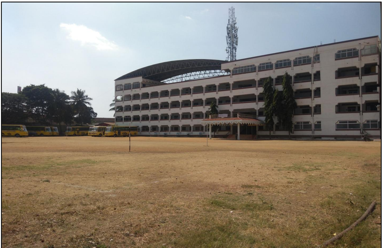
College Play Ground